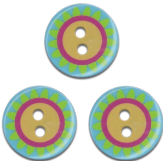
Turquoise Petals 3284