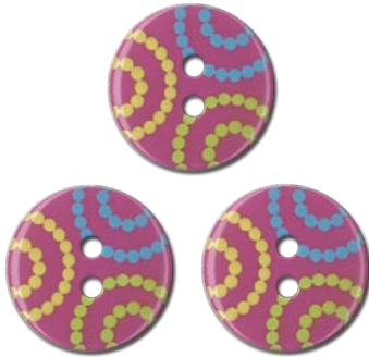
Pink Dots 3278