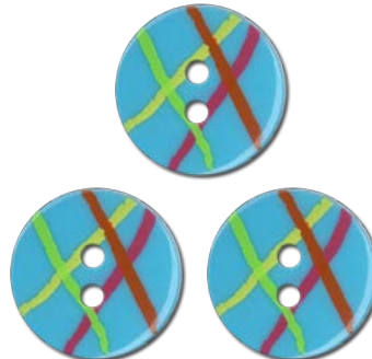
Turquoise Lines 3279