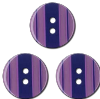
Purple Stripes 3285