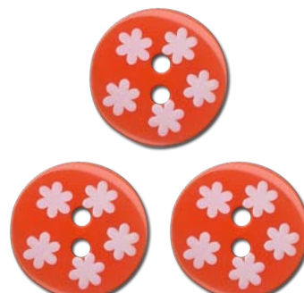
Orange & White Flowers 3282