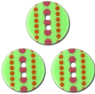
Striped Dots 3276