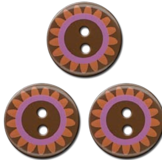
Pink Petals 3277