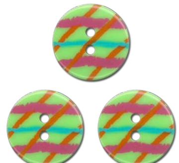
Lime Lines 3283