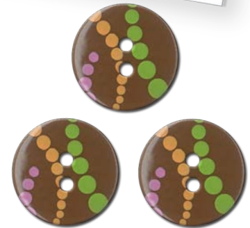
Brown Curves 3280